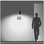
On one side