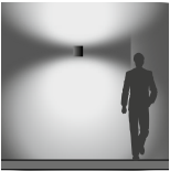
On two sides