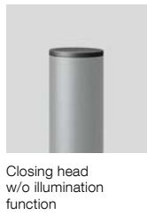
Closing head w/o illumination function