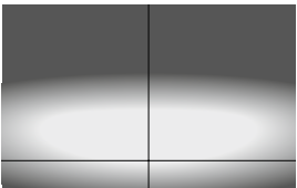
Asymmetric wide beam

NRTL listed to North American standards · Suitable for wet locations Protection class IP 65