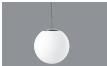
For pendant luminaires, see page 156.