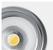
Partially frosted crystal glass

NRTL listed to North American Standards, interior use only Refer to page 185 for more information